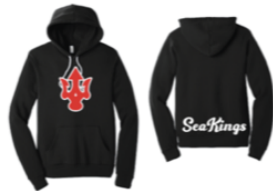
BLACK PULLOVER BELLA HOODIE $45 Sizes XS-XXL