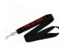
PVHS LANYARD $5