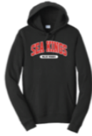
BLACK PULLOVER HOODIE 80/20 cotton/ply $45 Adult sizes S-3XL